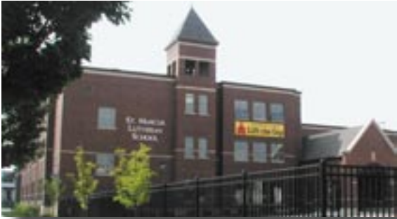
St. Marcus Lutheran School • 2215 N. Palmer Street

St. Marcus School has served families in the north side Brewer’s Hill neighborhood since 1872. Spurred by expansion in the MPCP, St. Marcus Lutheran Church raised $5.6 million in private grants and loans to build a new school that opened for the 2003-2004 school year. The 56,000 square foot, three-story, red-brick school has vastly improved capacity from the former, now-demolished school. St. Marcus enrolls 270 students, 230 of whom receive MPCP vouchers.