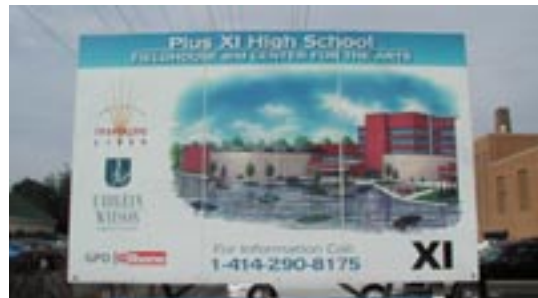
Pius XI High School • 135 N. 76th Street

Originally opened in 1929, Pius joined the MPCP in 1997. The school serves 238 choice students out of 1,241 on Milwaukee’s west side. It continues to fill the growing need for high school spots in the MPCP. The $7.1 million in grants and loans to be paid back by private donations are being used to build a new state-of-the-art athletic field house and performing arts center.