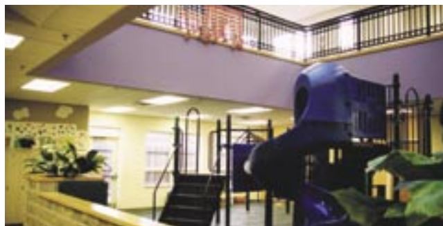
Yeshiva Elementary School • 5115 W. Keefe Avenue