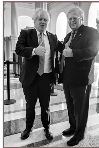
Former UK Prime Minister Boris Johnson gave me the thumbs up!

Tally-ho! You never know who you'll run into at the Texas Capitol. Greeting former British Prime Minister Boris Johnson walking in at the East entrance was pretty cool. The Prime Minister asked if I had been passing any good bills lately, and I shared with him a couple of Senate Bills on election integrity, SB 1750 & SB 1933, that had just rocketed out of the Texas Senate! He asked if we had Photo ID to vote in Texas, and I said "Yes, of course!"