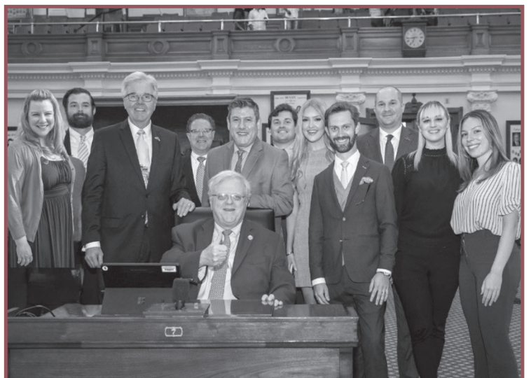
Lt. Governor Dan Patrick joins the photo of my Senate District 7 Staff members!