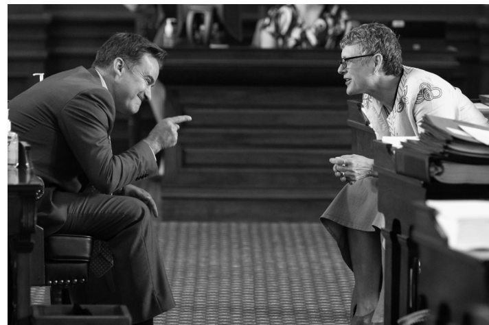
Senator Gutierrez with Senator Eckhardt of Austin.

The budget is the only bill required by the Texas Constitution to be passed by our Legislature each session. The 87th Legislature passed a $248 billion budget, allocating $116 billion in revenue toward government operations and programs. This budget signals a $13.5 billion reduction in overall spending from last session's budget. The budget allocates roughly $8.6 billion toward higher education, ensuring that Texas universities will continue to build the brightest minds of tomorrow.