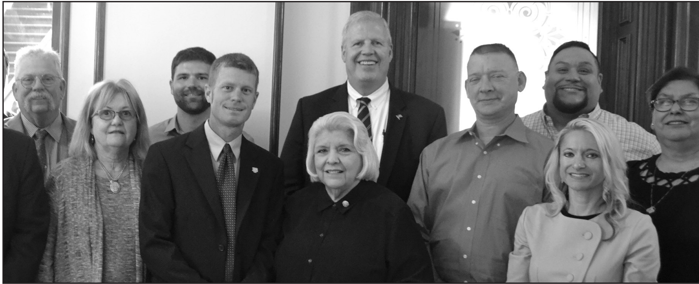
CALDWELL COUNTY AND LOCKHART LEADERS visit the State Capitol to discuss shared priorities with Senator Judith Zaffirini.