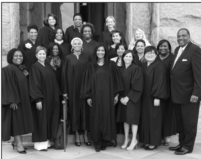
April 4, 2017 was Texas Women Judges Day at the Capitol. Dallas County Women Judges were recognized on the Senate floor by Sen. West.

The Senate and House had different opinions on whether the state's Economic Stabilization Fund (Rainy Day Fund) should be used to plug budget gaps. The House proposed its use on school finance. The decision reached would use $998 million of the Rainy Day Fund to support the budget, with $778 million of it to be spent on state-owned facilities like state hospitals and supported living centers through Health & Human Services; for emergency repairs and deferred maintenance on state-owned buildings, including TxDOT properties, on Alamo preservation efforts and state park maintenance. The Texas Department of Criminal Justice and the Juvenile Justice Department combined will receive about $52 million from the rainy day pot. The Rainy Day Fund is projected to grow to more than $11 billion by the end of 2019.