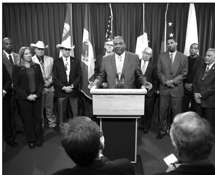
Law enforcement, ministers and advocates joined Sen. West, Lt. Gov. Dan Patrick and joint author Sen. John Whitmire for a news conference to discuss SB30 , The Community Safety Education Act .

By the time the 2020 Presidential Election takes place, straight ticket voting will no longer be possible in Texas due to HB25 , which passed during the Regular Session. And under SB5 passed during the Special Session to deter mail-in ballot fraud, there is also language that could create a state jail felony offense if, for example, a relative or friend advises or otherwise assists a senior to complete a mail-in ballot.