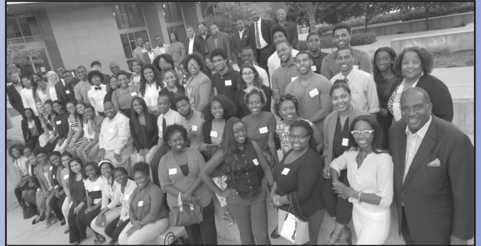
2017 Dr. Emmett J. Conrad Leadership Program interns and sponsors.

Information regarding the 2018 Dr. Emmett J. Conrad Leadership Program application process can be found at www.conradleadership.com . Summer 2018 will mark the program's 25th year. In noting this milestone, we have launched a reclamation campaign to locate, document and celebrate the success of past interns/current alums through the creation of a Conrad directory.