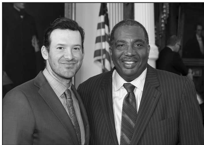
Retired Dallas Cowboy Quarterback Tony Romo was a visitor to the Texas Capitol.

In 2015, I authored SB1462 which became law to allow those close to persons suffering from opioid addiction to obtain a prescription for the drug naloxone, an opioid antagonist, from pharmacists without a prescription and without issuer liability. With opioid overdoses having quadrupled since 1999 and the issue a matter of daily discussion, I was able to write SB584 as follow-up legislation this session. About half of all opioid overdoses are produced by prescription drugs. The bill requires the state medical board to develop guidelines, along with the pharmacy board, to allow an opioid antagonist to be prescribed to at-risk patients alongside the opioid prescription.