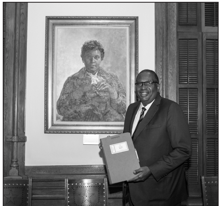
Senator West paying homage to former Texas Senator and Congresswoman Barbara Jordan after passage of HCR5 .

The map will identify every public school in Texas and indicate whether it has broadband access. HB5 creates and funds the Broadband Development Program to assist expansion by awarding grants and low-interest loans to applicants in low-access areas.