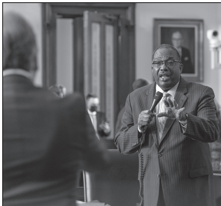
Senator West during debate in Senate Chamber.

More Texans voted in 2020 than ever before and the percentage of those who turned out to vote was the highest since 1992. Nationally, Texas ranks among the lowest in voter turnout and in its percentage of registered voters. So why, following the highest turnout ever, would we pursue legislation that observers say makes voting more difficult?