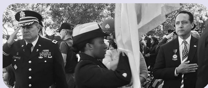
Thank you to all our veterans for your service to our country!

★ Co-Sponsored House Bill 1535 (Medical Cannabis) - Provides necessary improvements to the Texas Compassionate Use Program so patients with debilitating medical conditions, including post-traumatic stress disorder (PTSD), may access low-THC cannabis products for treatment.