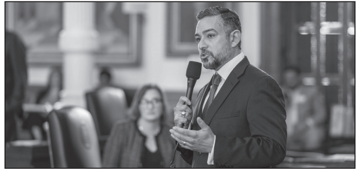
Senator Blanco delivering a speech on the Senate Floor.

After years of teaching our students, retired teachers deserve to live in retirement comfortably and with dignity. This session, we reaffirmed our support for our retired teachers by passing SB10 and HJR2 to invest $3.3 Billion to ensure a more financially secure retirement for our teachers. With this investment, retired teachers will receive a long-overdue Cost-of-Living-Adjustment (COLA), a 13th check for an average amount of $2,300, and a freeze on TRS Care insurance premiums.