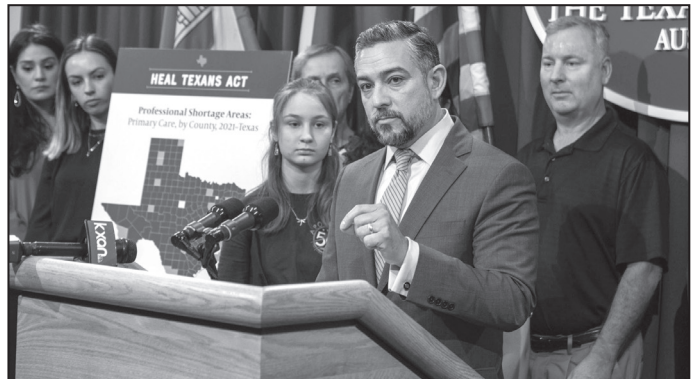
Senator Blanco leading a press conference on the HEAL Texans Act to expand healthcare access and options.

To help families get the proper care when they need it, I filed and passed SB1526, authorizing the Big Bend Regional Hospital District to provide EMS services and regionalize EMS operations. Additionally, SB1588 helps EMS providers hire qualified ambulance drivers, enhancing response and care.