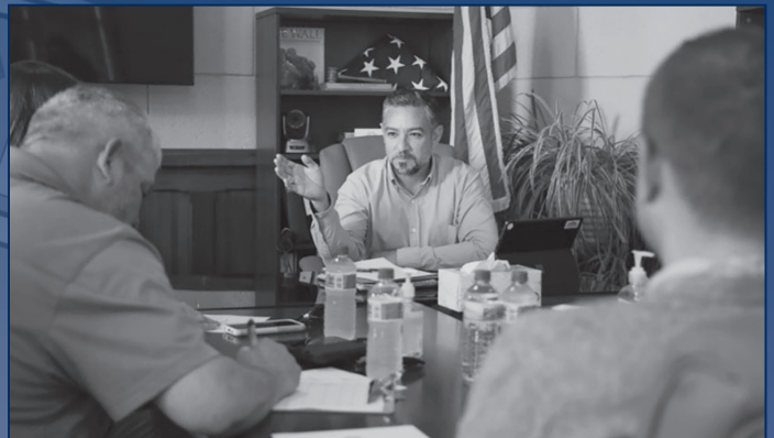
Senator Blanco meets with local community leaders to discuss legislative priorities for the 88th legislative session.